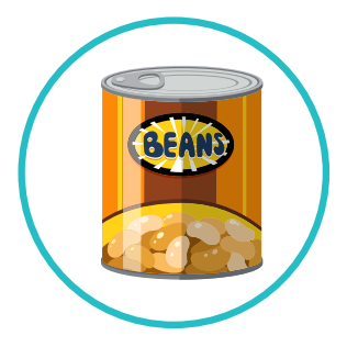
BEANS & LENTILS