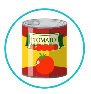
CANNED TOMATOES (WHOLE, DICED, CRUSHED)