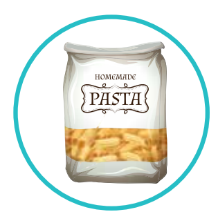
RICE, PASTA, GRAINS