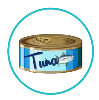
CANNED FISH (TUNA, SALMON, SARDINES)