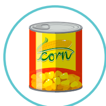
CANNED FRUIT & VEGETABLES