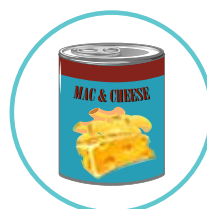
MAC & CHEESE INSTANT NOODLES