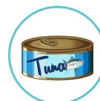
CANNED FISH AND MEAT