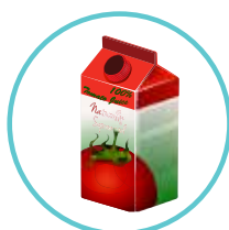
100% FRUIT JUICES & DRINK BOXES