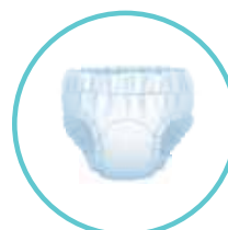
DIAPERS (SIZE 5/6)