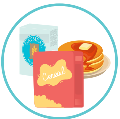
BREAKFAST FOODS (OATMEAL, CEREAL, PANCAKE MIX)