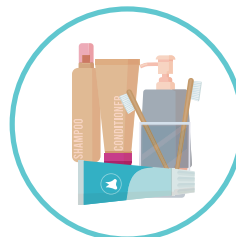
HYGIENE ITEMS (SHAMPOO, TOOTHPASTE, DEODORANT)