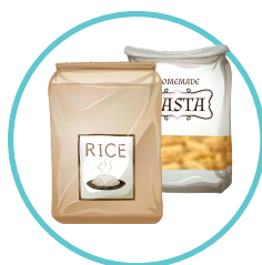
RICE AND PASTA NOODLES