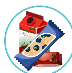
HEALTHY SNACKS (JUICE BOXES, GRANOLA BARS, FRUIT CUPS)