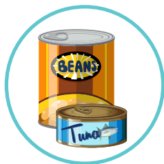
CANNED PROTEIN (TUNA, BAKED BEANS)