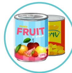
CANNED FRUIT & VEGETABLES