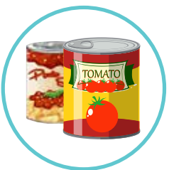
TOMATO SAUCE & CANNED TOMATOES